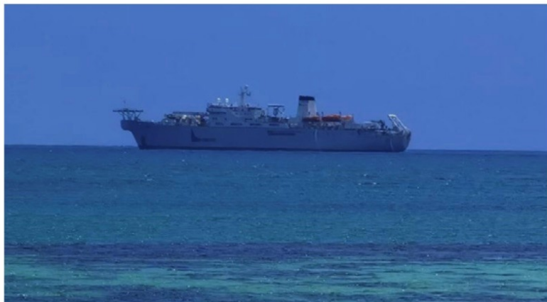
The cable ship laying the shore-end of the Seychelles branch is the CS NIWA of E-Marine (picture of the NIWA close to Perseverance).

system started a few months ago and the cable-laying ship, the CS